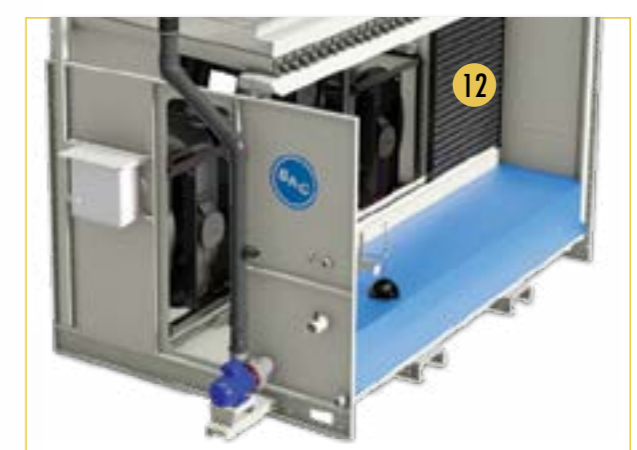
i Only for previous generation models PLC 12. Combined inlet shields