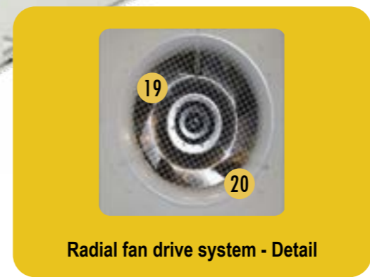
Radial fan drive system - Detail

Quantities may vary according to the unit type.