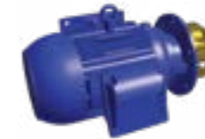
Spray pump without volute