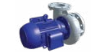
Spray pump with volute