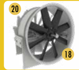
Axial fan - Fan air inlet shields